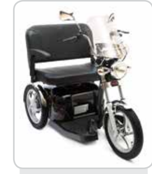
Sport Rider with Dual Seat