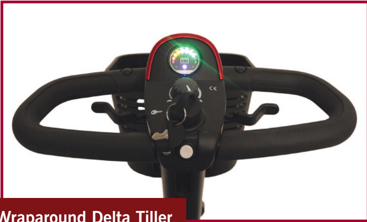
Wraparound Delta Tiller