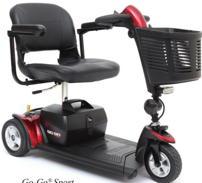
Go-Go® Sport, 3-Wheel

The Go-Go® Sport delivers high-performance operation and easy disassembly for convenience on-the-go. With a 325 lbs. weight capacity, charger port in tiller, and standard front LED lighting, the Go-Go Sport is feature rich and travel ready.