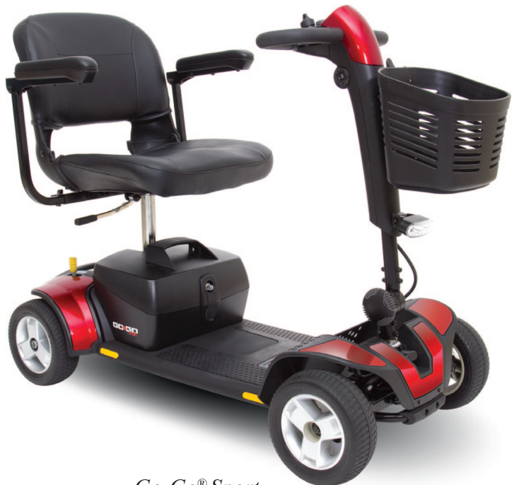
Go-Go® Sport, 4-Wheel